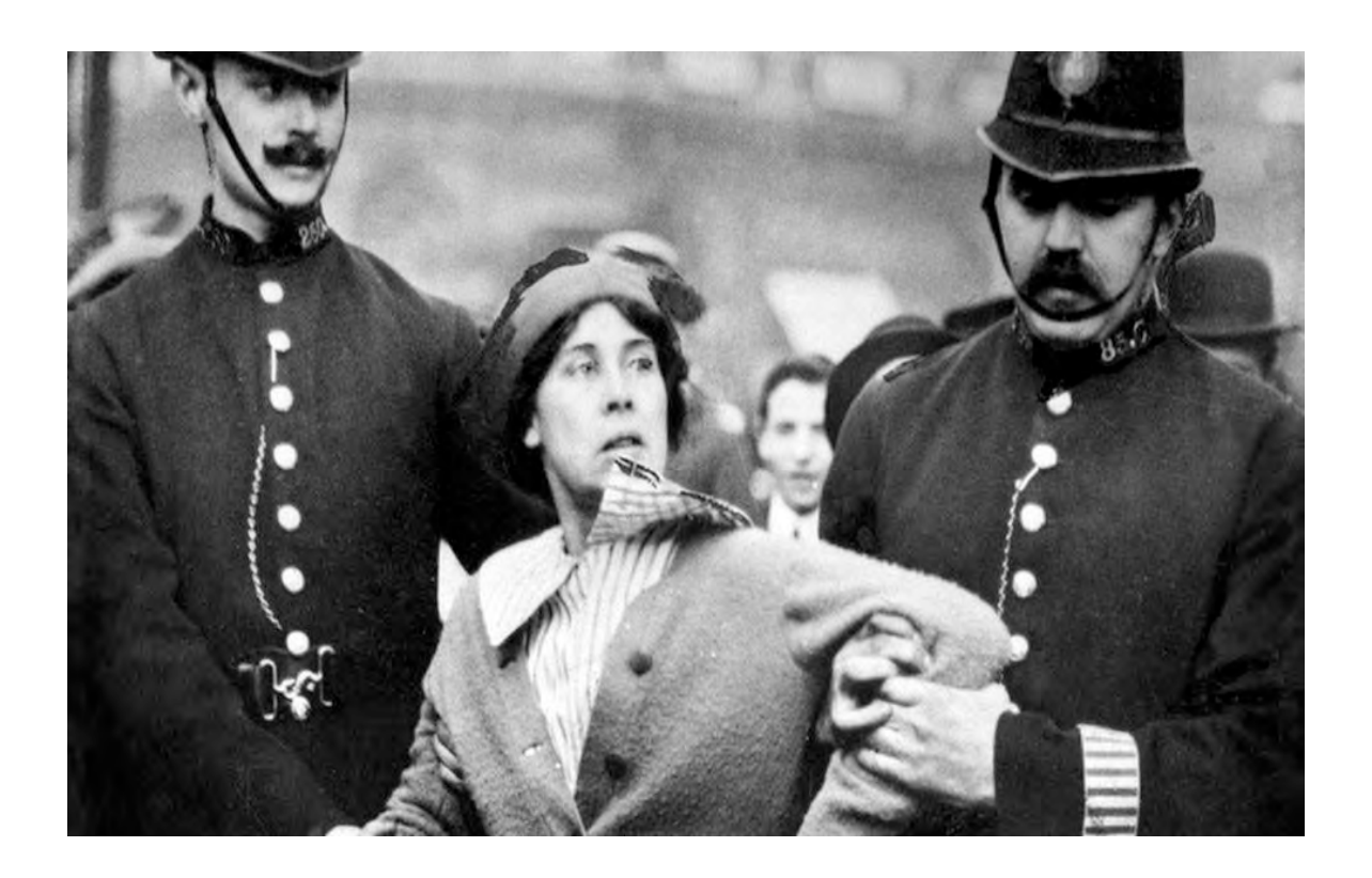
The fight for equality continues.

Voter Services still needs a leader! Of all the important LWV committees, Voter Services is the most important. Projects like the New Voter Rules PSA, Candidates' Nights, Voter Registration efforts, etc. need an organizer. Please step up to fill this important position as we move closer to November's election. It is a strong committee with lots of seasoned members to help you learn to lead it.